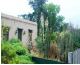
DAWSON CACTUS GARDENS SOHE 2008