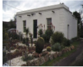
1 dawson cactus bendigo rear view of house & garden aug1997