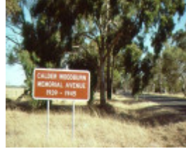
H01975 1 calder woodburn memorial avenue jh mar98