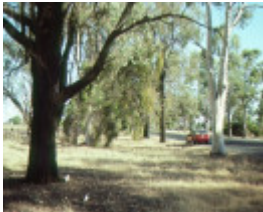
H01975 calder woodburn memorial avenue3 jh mar98