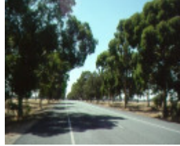
H01975 calder woodburn memorial avenue2 jh mar98