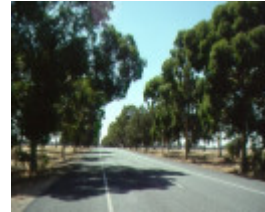
H01975 calder woodburn memorial avenue2 jh mar98