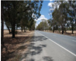
CALDER WOODBURN MEMORIAL AVENUE SOHE 2008