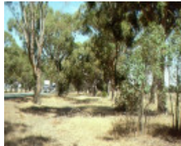
H01975 calder woodburn memorial avenue4 jh mar98