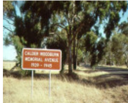
H01975 1 calder woodburn memorial avenue jh mar98