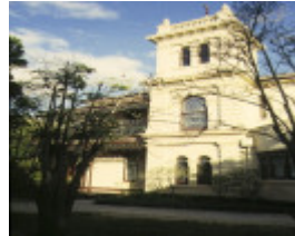
1 former clydebank vida street essendon front tower may1996