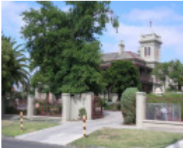
FORMER CLYDEBANK SOHE 2008