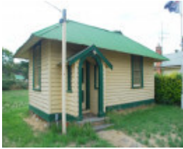
FORMER NEWSTEAD SHIRE CHAMBERS SOHE 2008