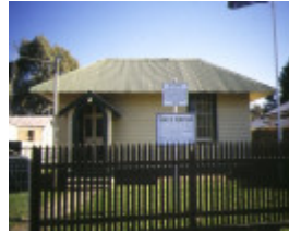
1 former newstead shire chambers castlemaine guildford road campbells creek front detail jun1997