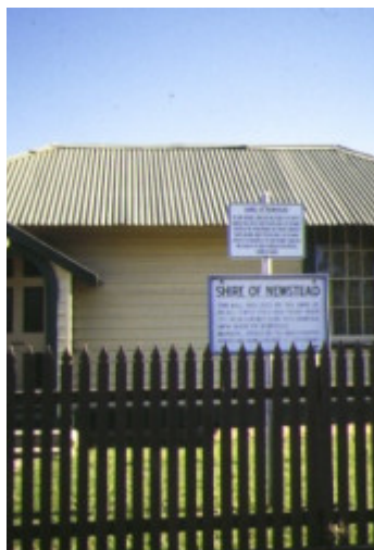
1 former newstead shire chambers castlemaine guildford road campbells creek front detail jun1997