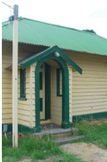
FORMER NEWSTEAD SHIRE CHAMBERS SOHE 2008