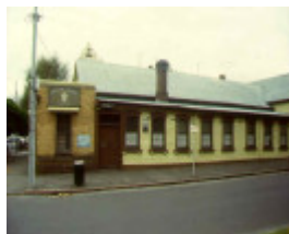
1 east collingwood rifles volunteer ordely room east melbourne