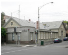
EAST COLLINGWOOD RIFLES VOLUNTEER ORDERLY ROOM SOHE 2008