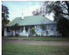
1 ellerslie pilmer street bacchus marsh front view homestead