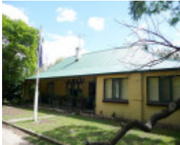
ELLERSLIE SOHE 2008