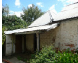
ELLERSLIE SOHE 2008