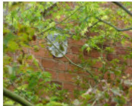
ELLERSLIE SOHE 2008