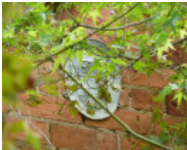
ELLERSLIE SOHE 2008