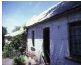
ellerslie pilmer street bacchus marsh front view cottage entrance