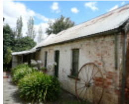
ELLERSLIE SOHE 2008