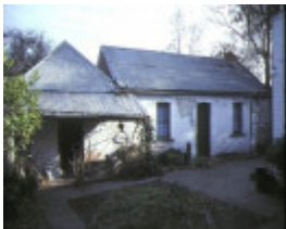
ellerslie pilmer street bacchus marsh front view cottage & coolroom