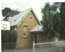
1 bundooora primary school no 1915 plenty road bundooora front view may1997