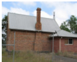
BUNDOORA PRIMARY SCHOOL NO.1915 SOHE 2008