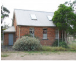
BUNDOORA PRIMARY SCHOOL NO.1915 SOHE 2008