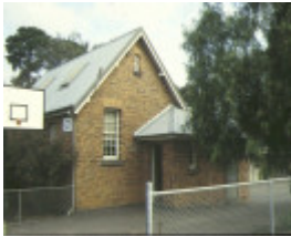
1 bundoora primary school no 1915 plenty road bundoora front view may1997