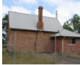
BUNDOORA PRIMARY SCHOOL NO.1915 SOHE 2008