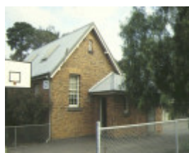
1 bundooora primary school no 1915 plenty road bundooora front view may1997