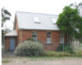
BUNDOORA PRIMARY SCHOOL NO.1915 SOHE 2008