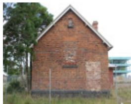
BUNDOORA PRIMARY SCHOOL NO.1915 SOHE 2008