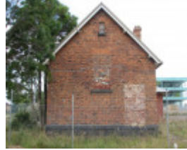
BUNDOORA PRIMARY SCHOOL NO.1915 SOHE 2008