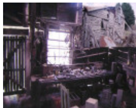
1 blacksmiths shop & residence hale street strathbogie residence