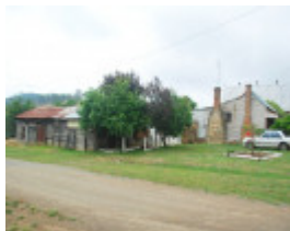
BLACKSMITHS SHOP AND RESIDENCE SOHE 2008