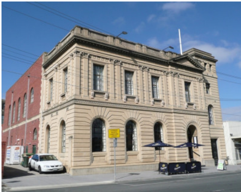
FORMER GEELONG WOOL EXCHANGE SOHE 2008