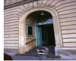
former geelong wool exchange corio street geelong detail of front entrance