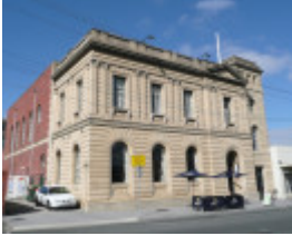
FORMER GEELONG WOOL EXCHANGE SOHE 2008