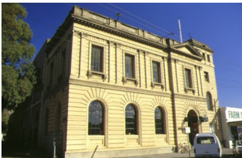
1 former geelong wool exchange corio street geelong front view