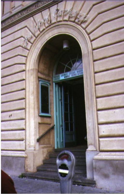
former geelong wool exchange corio street geelong detail of front entrance