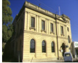
1 former geelong wool exchange corio street geelong front view