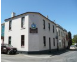
FORMER SCOTTISH CHIEFS HOTEL SOHE 2008