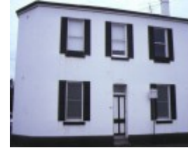
former scottish chiefs hotel geelong front view