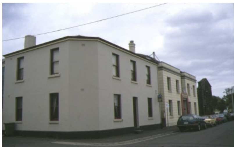
1 former scottish chiefs hotel geelong corner view apr1997