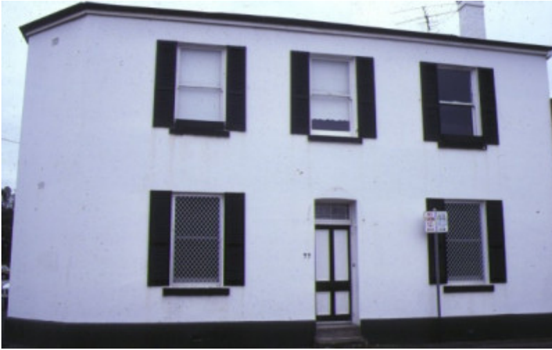
former scottish chiefs hotel geelong front view