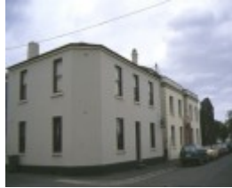
1 former scottish chiefs hotel geelong corner view apr1997