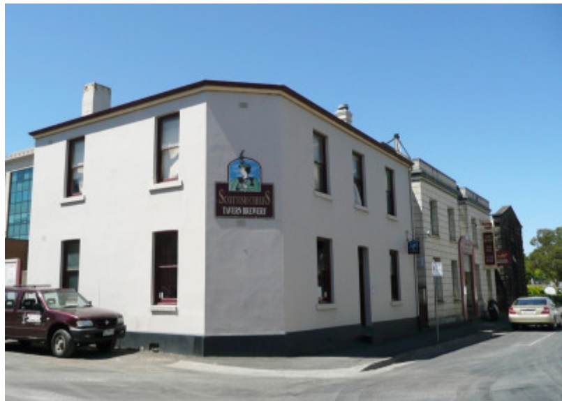
FORMER SCOTTISH CHIEFS HOTEL SOHE 2008