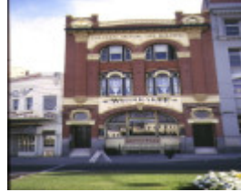
1 former royal bank bendigo front view apr1997