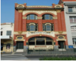
FORMER ROYAL BANK SOHE 2008