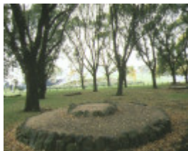
1 yarra bank speakers corner batman avenue melbourne view of speakers rings