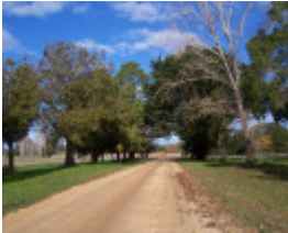
Hotspur Avenue of Honour