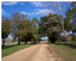
Hotspur Avenue of Honour