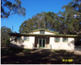
52353 Memorial Hall HOtspur 061