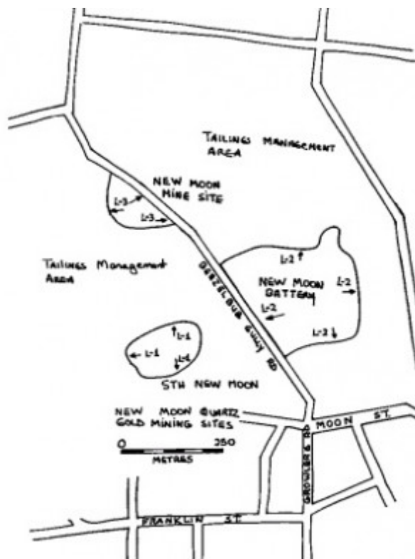
new moon quartz gold mine sites eaglehawk plan