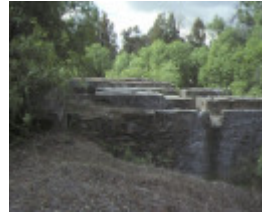
1 new moon quartz gold mine sites eaglehawk remains of winding gear may1993