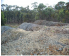
NEW MOON QUARTZ GOLD MINE SITES SOHE 2008