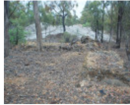
NEW MOON QUARTZ GOLD MINE SITES SOHE 2008