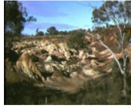
1 pink cliffs hydraulic gold sluicing site heathcote landscape