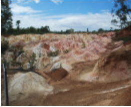
PINK CLIFFS HYDRAULIC GOLD SLUICING SITE SOHE 2008