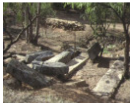
1 golconda glasgow reef golden gully boiler footings may1993