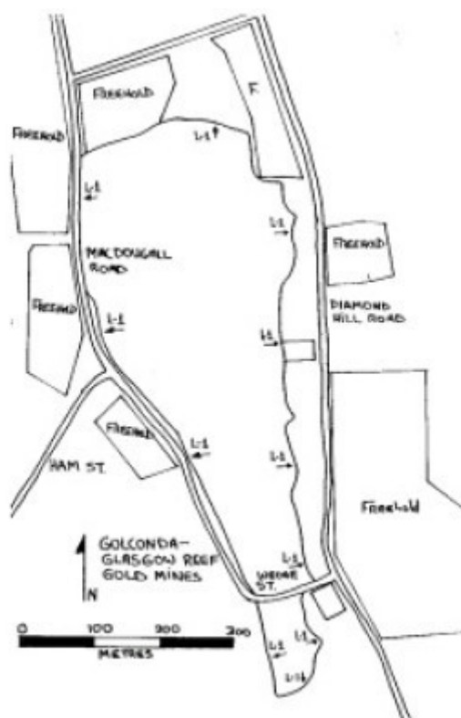
golconda glasgow reef golden gully battery plan