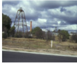
1 deborah co quartz gold mine site view may 1993