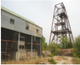
DEBORAH COMPANY QUARTZ GOLD MINE SOHE 2008