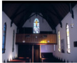
h01350 holy trinity anglican church and sunday school davy street taradale inside church she project 2003