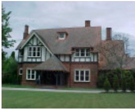
H01399 residence formerly colinton mont albert road canterbury front view nov2001