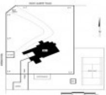
Residence Formerly Colinton Mont Albert Road Canterbury Plan