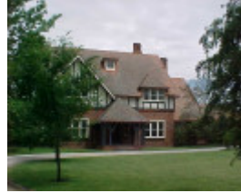
H01399 1 residence formerly colinton mont albert road canterbury front view nov2001