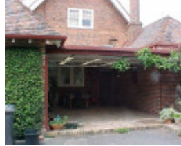
H01399 residence formerly colinton mont albert road canterbury courtyard nov2001