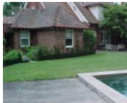
H01399 residence formerly colinton mont albert road canterbury sw corner nov2001