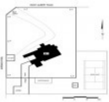
Residence Formerly Colinton Mont Albert Road Canterbury Plan