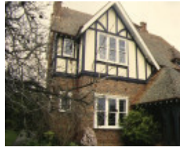
H01399 residence formerly colinton mont albert road canterbury front view aug1997