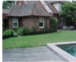
H01399 residence formerly colinton mont albert road canterbury sw corner nov2001