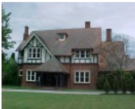
H01399 residence formerly colinton mont albert road canterbury front view nov2001