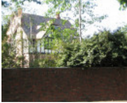
RESIDENCE (FORMERLY COLINTON) SOHE 2008