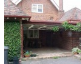
H01399 residence formerly colinton mont albert road canterbury courtyard nov2001