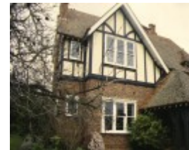
H01399 residence formerly colinton mont albert road canterbury front view aug1997