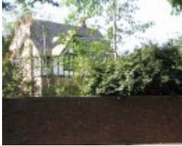
RESIDENCE (FORMERLY COLINTON) SOHE 2008