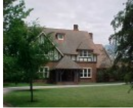
H01399 1 residence formerly colinton mont albert road canterbury front view nov2001