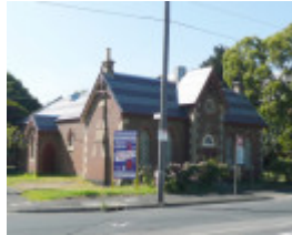
ST PAULS CHURCH OF ENGLAND SOHE 2008