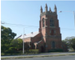
ST PAULS CHURCH OF ENGLAND SOHE 2008