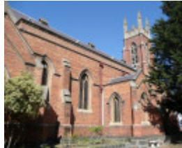
ST PAULS CHURCH OF ENGLAND SOHE 2008