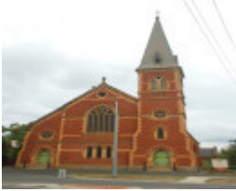
UNITING CHURCH SOHE 2008