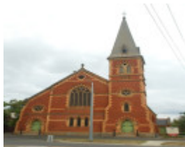
UNITING CHURCH SOHE 2008