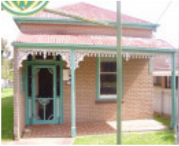
52841 CWA ROOMS