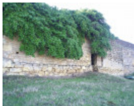
53002 Yannarie Butter Factory 2