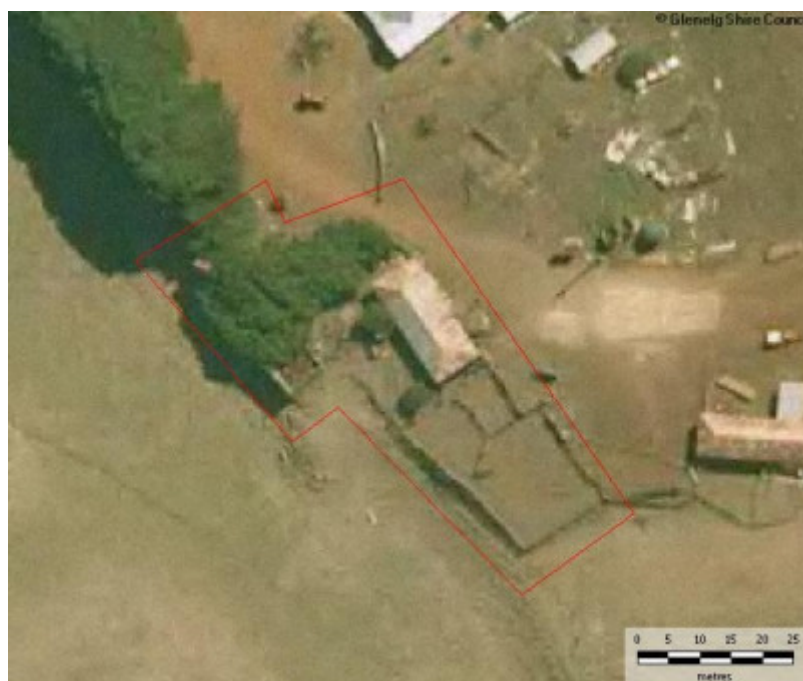
MAP 1 - Extent of Registration