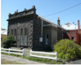
MASONIC HALL SOHE 2008