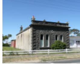
MASONIC HALL SOHE 2008