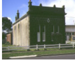
1 masonic hall camperdown front view sep1997