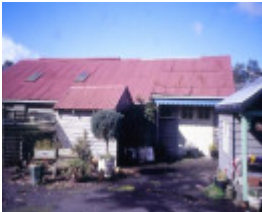
camperdown steam laundry paton street camperdown shed she project 2003