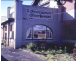
camperdown steam laundry paton street camperdown front sign she project 2003