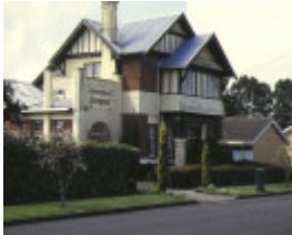
1 camperdown steam laundry front view sep1997