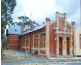
FORMER COMMON SCHOOL NO. 981 SOHE 2008