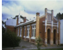
1 former common school number 981 kangaroo flat front corner view jan1993