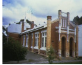
1 former common school number 981 kangaroo flat front corner view jan1993