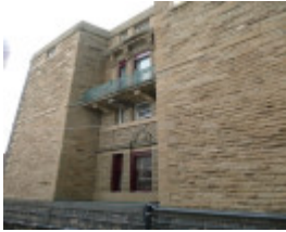
FORMER ES&A BANK SOHE 2008