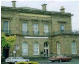
former es&a bank malop street geelong front detail publication