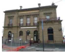
FORMER ES&A BANK SOHE 2008