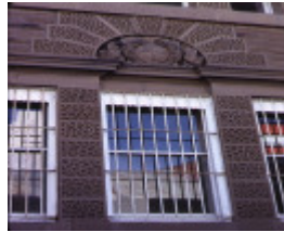
former es&a bank malop street geelong detail external window