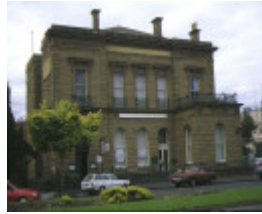
1 former es&a bank geelong front view