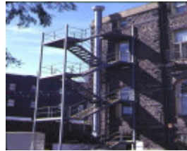
former es&a bank malop street geelong fire escape