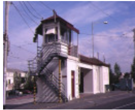
1 tramway signal cabin waiting shelter & conveniences swanston street malbourne stair view jan1998