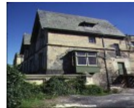
former geelong grammar school maud street geelong side view