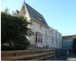
FORMER GEELONG GRAMMAR SCHOOL SOHE 2008