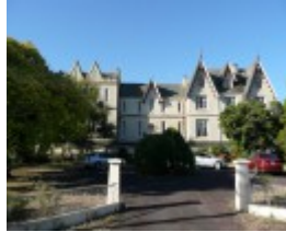
FORMER GEELONG GRAMMAR SCHOOL SOHE 2008