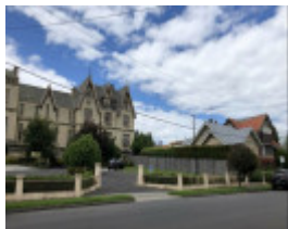
Maud Street elevation with bungalow at right