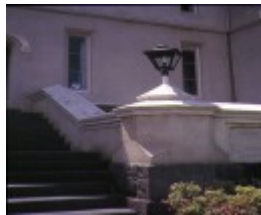
former geelong grammar school maud street geelong front stairs