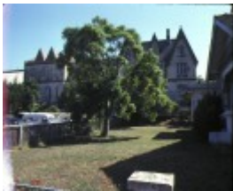
former geelong grammar school maud street geelong front and grounds