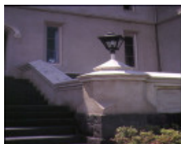
former geelong grammar school maud street geelong front stairs