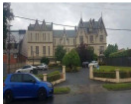
Maud Street Entrance