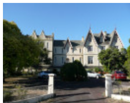
FORMER GEELONG GRAMMAR SCHOOL SOHE 2008