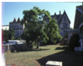
former geelong grammar school maud street geelong front and grounds