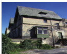
former geelong grammar school maud street geelong side view