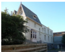
FORMER GEELONG GRAMMAR SCHOOL SOHE 2008