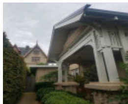
Verandah of Bungalow at 55A Maud Street