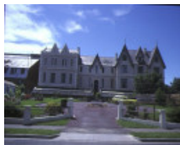
1 ormer geelong grammar school geelong front view