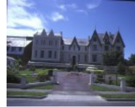
1 ormer geelong grammar school geelong front view