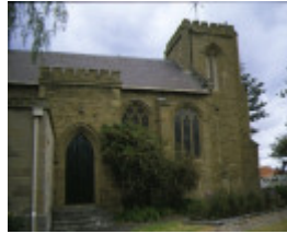
christ church mckillop street geelong church entrance side view