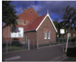
christ church geelong parish hall front