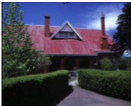
christ church geelong vicarage