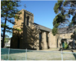
CHRIST CHURCH SOHE 2008