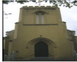
1 christ church geelong front view church