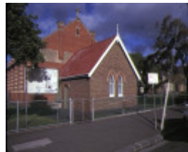
christ church geelong parish hall front