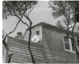
5345 Ramsay House Grounds on Deck