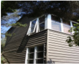
5345 Ramsay House Mt Eliza Enclosed North West Corner 23 March 2006 mz