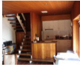
5345 Ramsay House Mt Eliza Living Area 23 March 2006 mz