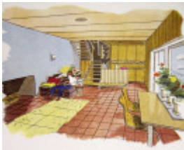
5345 Ramsay House Interior Circa 1944 02