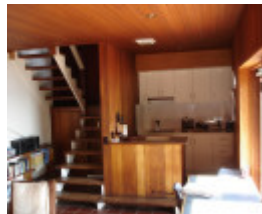
5345 Ramsay House Mt Eliza Living Area 23 March 2006 mz