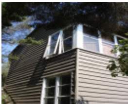
5345 Ramsay House Mt Eliza Enclosed North West Corner 23 March 2006 mz