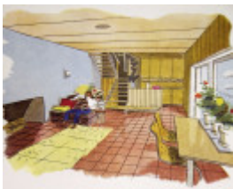
5345 Ramsay House Interior Circa 1944 02