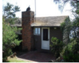
5345 Ramsay House Mt Eliza Enclosed Bedroom Balcony 23 March 2006 mz