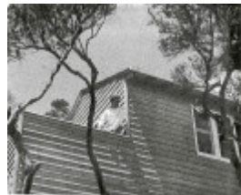
5345 Ramsay House Grounds on Deck