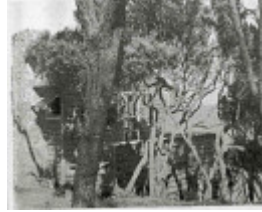
5345 Ramsay House Victorian Modern 001