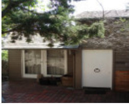
5345 Ramsay House Mt Eliza Front Door 23 March 2006 mz