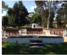
After Photograph - Reference F3921 2016