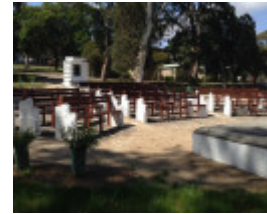
After Photograph - Reference F3921 2016