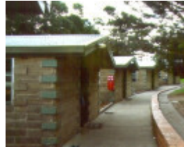
1 manyung recreation camp cabins june00