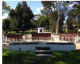
After Photograph - Reference F3921 2016