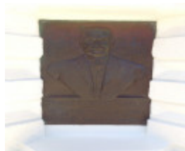
After Photograph - Reference F3921 2016