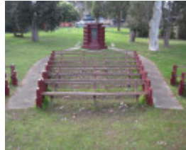
Before Photograph - Reference F3921 2014