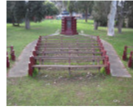
Before Photograph - Reference F3921 2014