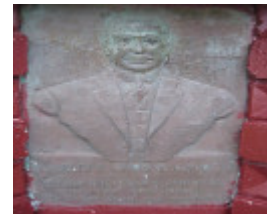
Before Photograph - Reference F3921 2014