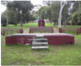
Before Photograph - Reference F3921 2014