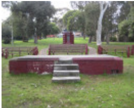
Before Photograph - Reference F3921 2014