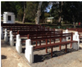
After Photograph - Reference F3921 2016