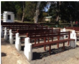
After Photograph - Reference F3921 2016