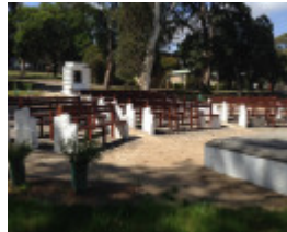
After Photograph - Reference F3921 2016