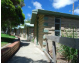
MANYUNG RECREATION CAMP SOHE 2008