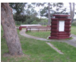
Before Photograph - Reference F3921 2014