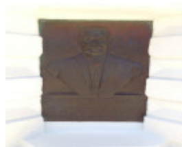
After Photograph - Reference F3921 2016