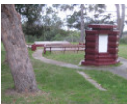
Before Photograph - Reference F3921 2014