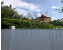
12 Staniland Avenue, Malvern