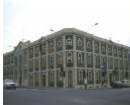
1 dennys lascelles wool stores geelong wool museum apr 1997