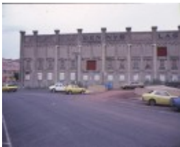
dennys lascelles wool stores geelong front view bow truss building demolished 1990