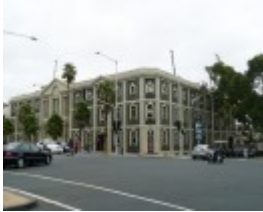
DENNYS LASCELLES WOOL STORES SOHE 2008