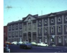
dennys lascelles wool stores geelong front view dennys lascelles feb 1970