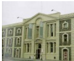
dennys lascelles wool stores geelong wool museum building front view publication