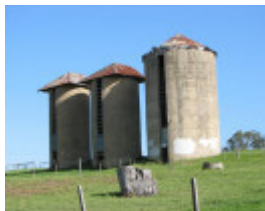
VIEWBANK HOMESTEAD SOHE 2008