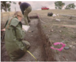
Viewbank Area C section drawing 97