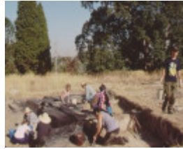
Viewbank Area A 97