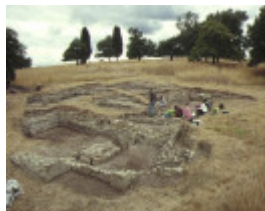
H01396 1 viewbank homestead view bank foundations mar1997