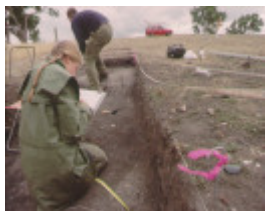
Viewbank Area C section drawing 97