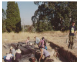
Viewbank Area A 97