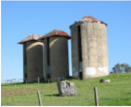
VIEWBANK HOMESTEAD SOHE 2008