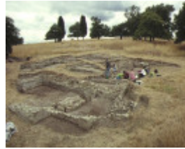
H01396 1 viewbank homestead view bank foundations mar1997