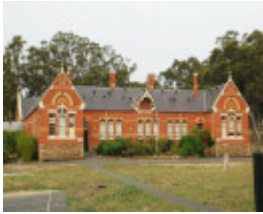
PRIMARY SCHOOL NO.1254 SOHE 2008