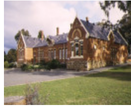
1 primary school number 1254 south west corner of high street maldon front view