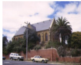
h01392 christ church mostyn street castlemaine side view nov1997