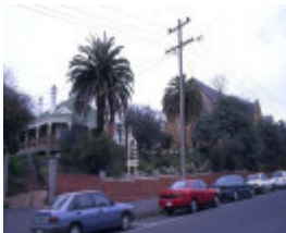
christ church mostyn st castlemaine rectory and church aspect she project 2003