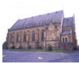
h01392 1 christ church mostyn st castlemaine south east aspect she project 2003