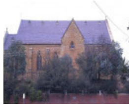
christ church mostyn st castlemaine iconic image she project 2003