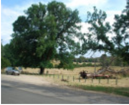
ROYAL OAKS SOHE 2008