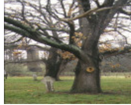
1 royal oaks taradale public park taradlae park view