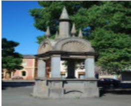
PATTERSON MEMORIAL DRINKING FOUNTAIN SOHE 2008