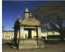
1 patterson memorial drinking fountain barker street castlemaine front view aug1997