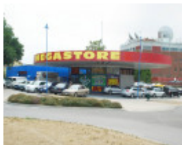
BEAUREPAIRE MOTOR GARAGE SOHE 2008