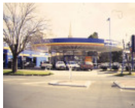
1 beaurepaire motor garage hargreaves street bendigo front view