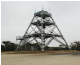
MOUNT TARRENGOWER LOOK-OUT TOWER SOHE 2008