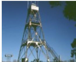
1 mount tarrengower lookout tower mount tarrengower maldon front view feb1997