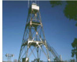
1 mount tarrengower lookout tower mount tarrengower maldon front view feb1997