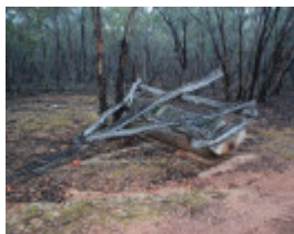
REUDINS EUCALYPTUS DISTILLERY SOHE 2008