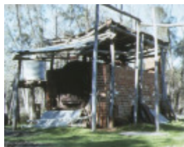
1 reudins eucalyptus distillery bendigo tennyson road bendigo front view