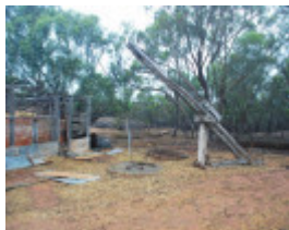
REUDINS EUCALYPTUS DISTILLERY SOHE 2008