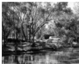
1 reudins eucalyptus distillery bendigo tennyson road bendigo view from water