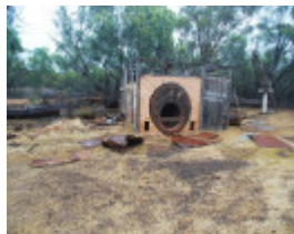
REUDINS EUCALYPTUS DISTILLERY SOHE 2008