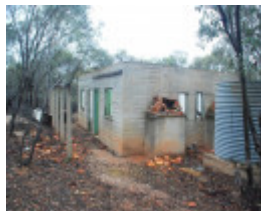
REUDINS EUCALYPTUS DISTILLERY SOHE 2008