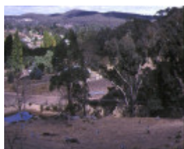
1 cemetery reef gully cemetery mount street chewton site view feb1997