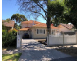
23 Berrima Avenue, Malvern East