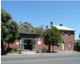
FORMER HM TRAINING PRISON SOHE 2008