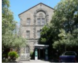
FORMER HM TRAINING PRISON SOHE 2008