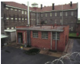
former hm training prison geelong northeast yard & services building aug1992