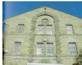
former hm training prison myers street geelong front elevation publication