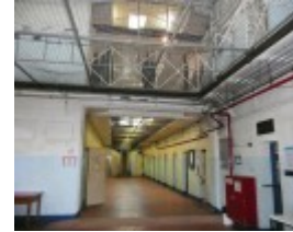
FORMER HM TRAINING PRISON SOHE 2008