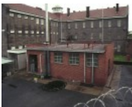
former hm training prison geelong northeast yard & services building aug1992