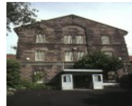
former hm training prison geelong forecourt north wing sep1992