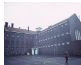
1 former hm training prison geelong east wing south east yard jul1984