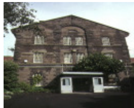
former hm training prison geelong forecourt north wing sep1992