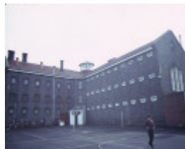
1 former hm training prison geelong east wing south east yard jul1984