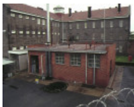
former hm training prison geelong northeast yard & services building aug1992