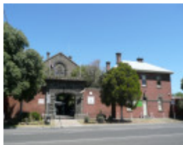
FORMER HM TRAINING PRISON SOHE 2008