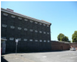
FORMER HM TRAINING PRISON SOHE 2008