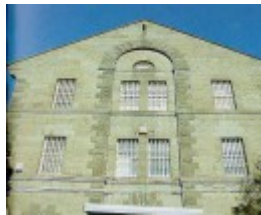
former hm training prison myers street geelong front elevation publication