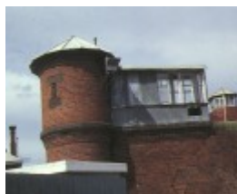
former hm training prison geelong watch tower sep1992