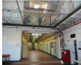
FORMER HM TRAINING PRISON SOHE 2008