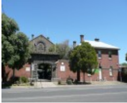
FORMER HM TRAINING PRISON SOHE 2008