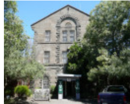
FORMER HM TRAINING PRISON SOHE 2008