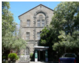
FORMER HM TRAINING PRISON SOHE 2008