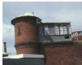
former hm training prison geelong watch tower sep1992