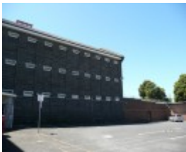
FORMER HM TRAINING PRISON SOHE 2008