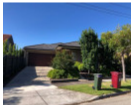
2 Hillard Street, Malvern East