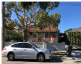
4 Hillard Street, Malvern East