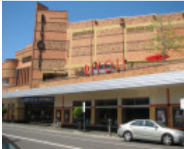
RIVOLI THEATRE SOHE 2008