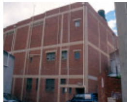
h01524 rivoli camberwell rear3