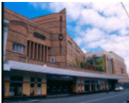
h01524 1 rivoli camberwell front facade