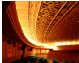
h01524 rivoli camberwell cinema1 detail