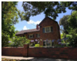
70 Nirvana Avenue, Malvern East